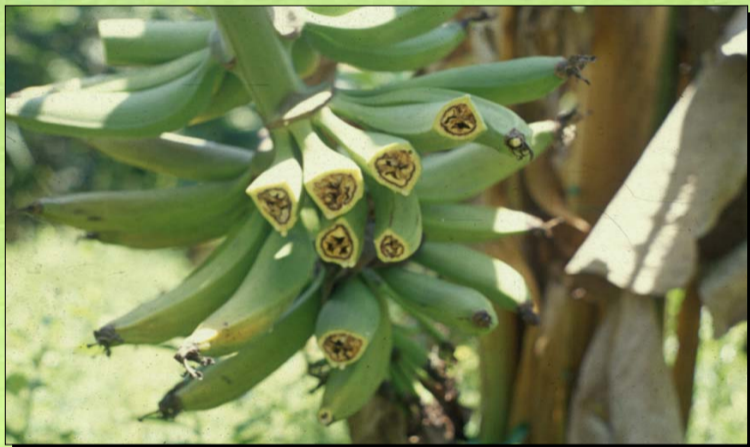
Moko , a wilt caused by the bacterium Ralstonia solanacearum .

About 95% of the country's farms are affected by moko , a bacterial wilt <<add?>> that can cause a 100% crop loss. Farmers consider current recommendations for managing moko as inefficient and demand that formalin, used to disinfect soil, be replaced with a nontoxic alternative.